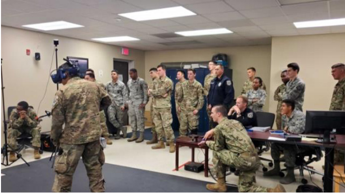
SVR is highly portable and flexible, so soldiers train anywhere indoors without disrupting the mission or installation

SVR includes robust features, environments, and scenarios catered to military police and security forces within the U.S. Armed Forces. The software supports a variety of military uniforms and allows instructors to set the ranks of trainees and other avatars.