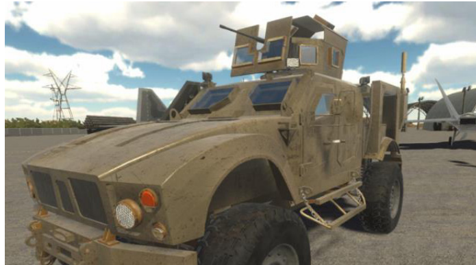
A custom-modeled Oshkosh M-ATV usable that can be dragged and dropped onto an environment as a prop.