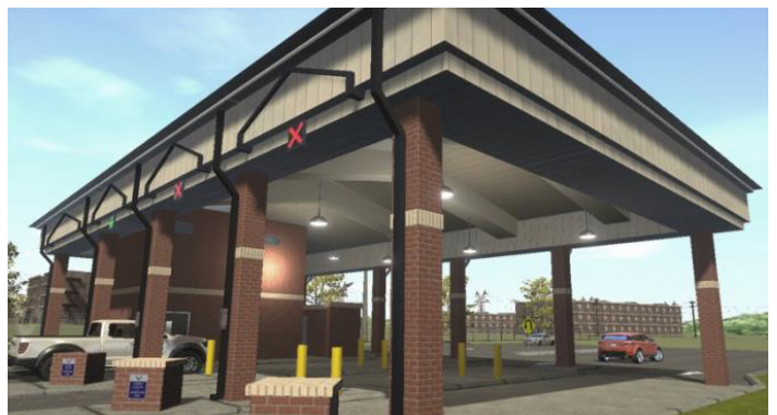
A base gate modeled exactly after a real gate at Robins Air Force Base.