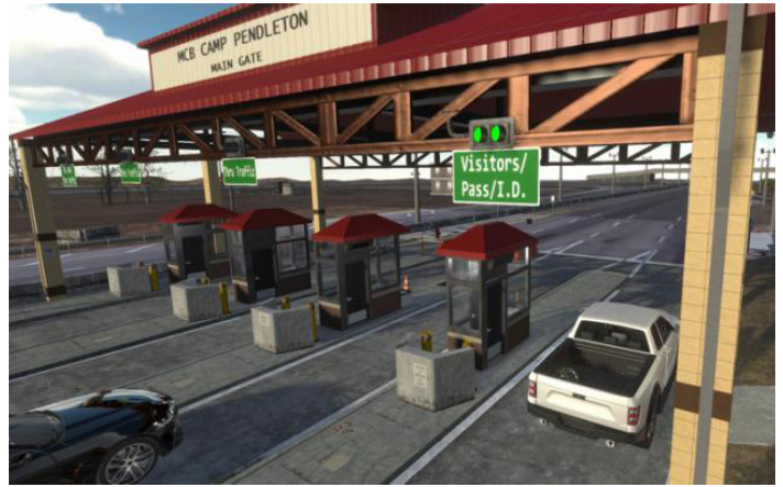
A base gate modeled exactly after a real gate at Marine

Reach out to InVeris Training Solutions today for a free demo to see how SVR can enhance your training program.