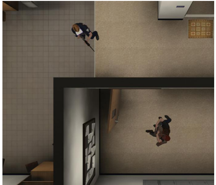
Top-down interface allows instructors to visualize entire environments and easily control suspect, bystander, and hostage actions.