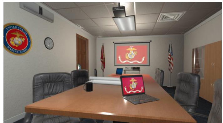
A conference room on a Marine Corps base.