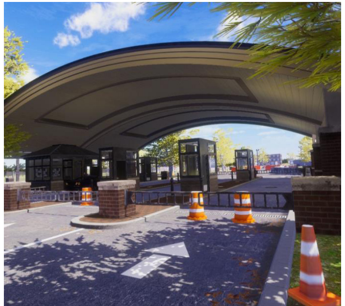
A base gate modeled exactly after a real gate at Air Force Joint Base McGuire-Dix-Lakehurst.