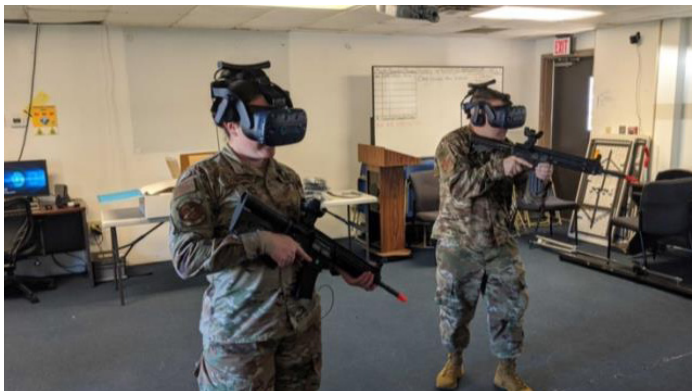
SVR's multi-user capability enriches the training experience by adding an extra layer of teamwork and communication.